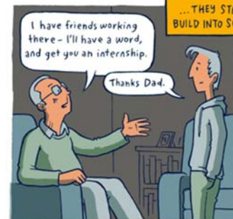
... THEY START TO ADD UP. TO BUILD INTO SOMETHING BIGGER.