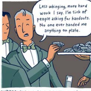
Less whinging, more hard work I say. I'm sick of people asking for handouts. No one ever handed me anything on plate.