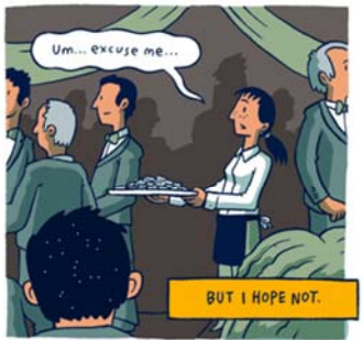
Um... excuse me...