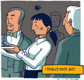
I REALLY HOPE NOT.