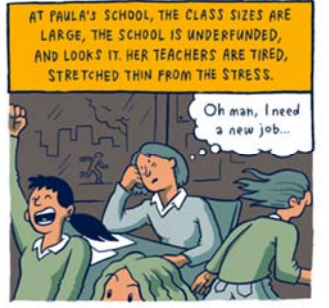
AT PAULA'S SCHOOL, THE CLASS SIZES ARE LARGE, THE SCHOOL IS UNDERFUNDED, AND LOOKS IT. HER TEACHERS ARE TIRED, STRETCHED THIN FROM THE STRESS.