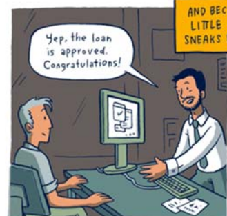
AND BECAUSE EACH LITTLE DIFFERENCE SNEAKS BY UNNOTICED...