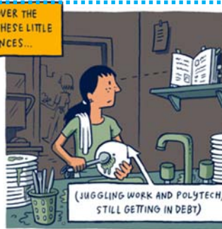
(JUGGLING WORK AND POLYTECH, STILL GETTING IN DEBT)