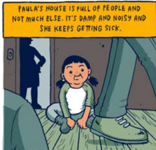
PAULA'S HOUSE IS FULL OF PEOPLE AND NOT MUCH ELSE. IT'S DAMP AND NOISY AND SHE KEEPS GETTING SICK.