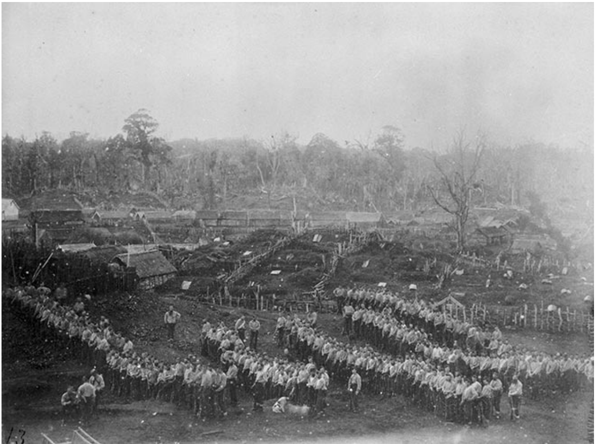
Armed constabulary prepare to advance on Parihaka in late 1881.